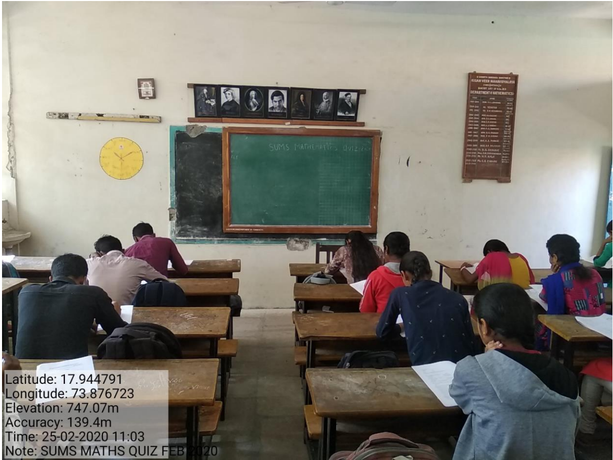
Latitude: 17.944791 Longitude: 73.876723 Elevation: 747.07m Accuracy: 139.4m Time: 25-02-2020 11:03 Note: SUMS MATHS QUIZ FEB 2020