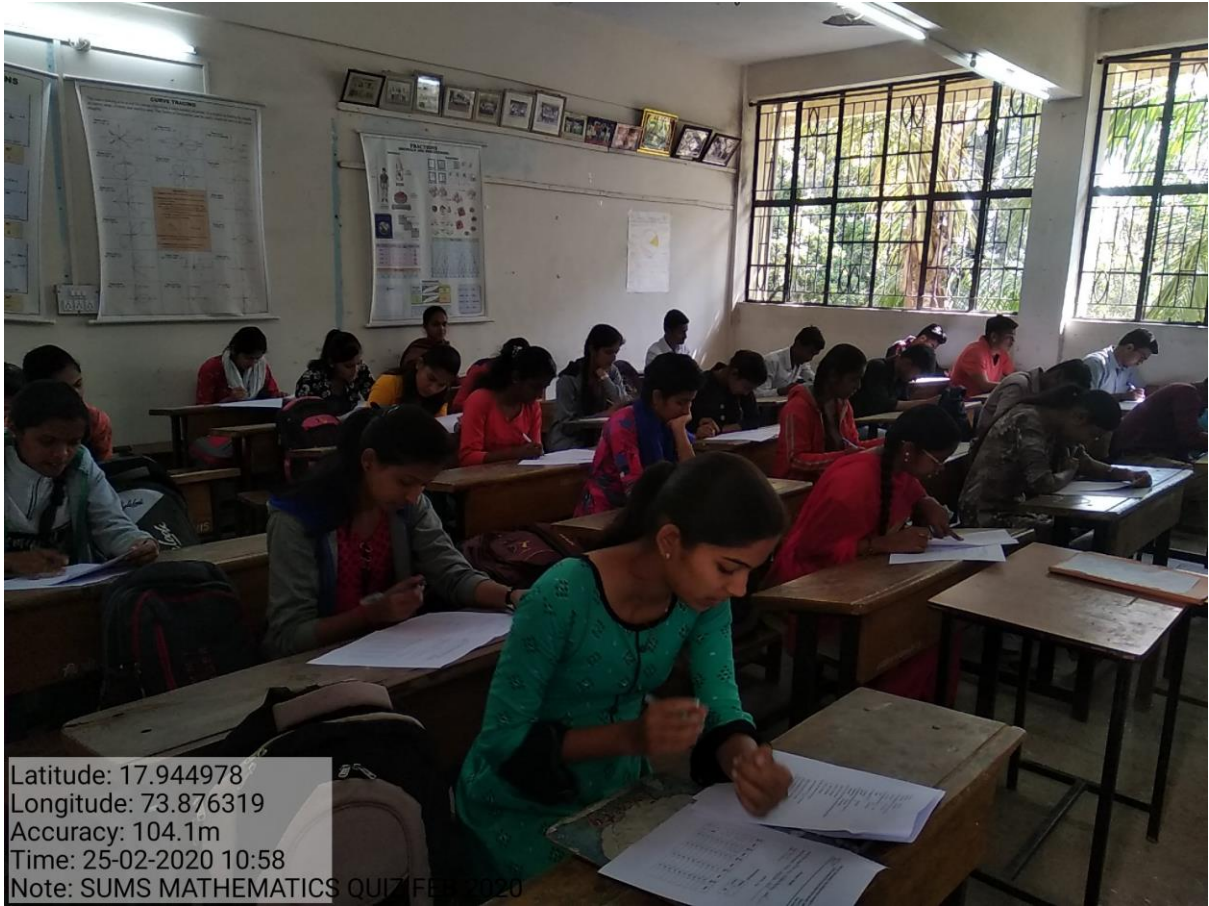
Latitude: 17.944978 Longitude: 73.876319 Accuracy: 104.1m Time: 25-02-2020 10:58 Note: SUMS MATHEMATICS QUIZ FEB 2020