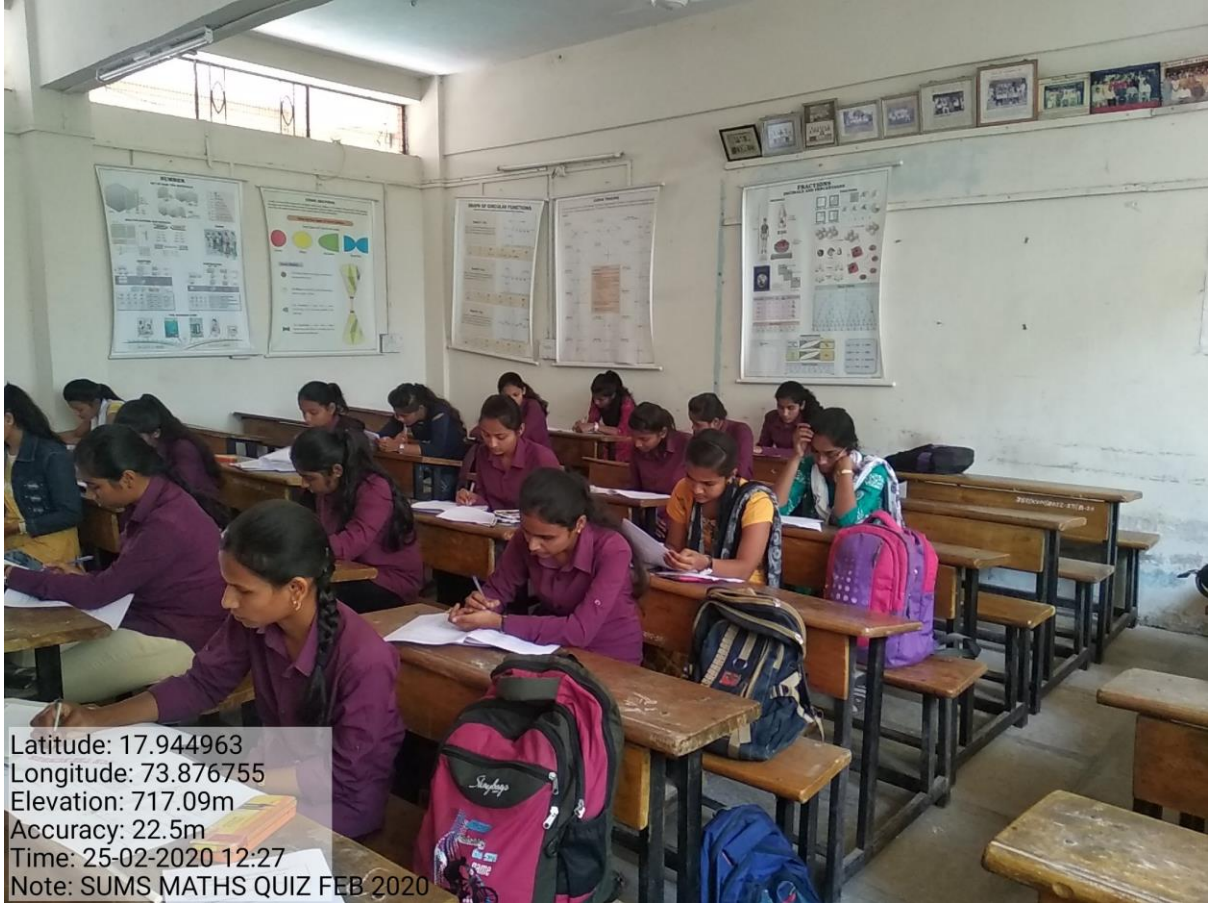
Latitude: 17.944963 Longitude: 73.876755 Elevation: 717.09m Accuracy: 22.5m Time: 25-02-2020 12:27 Note: SUMS MATHS QUIZ FEB 2020